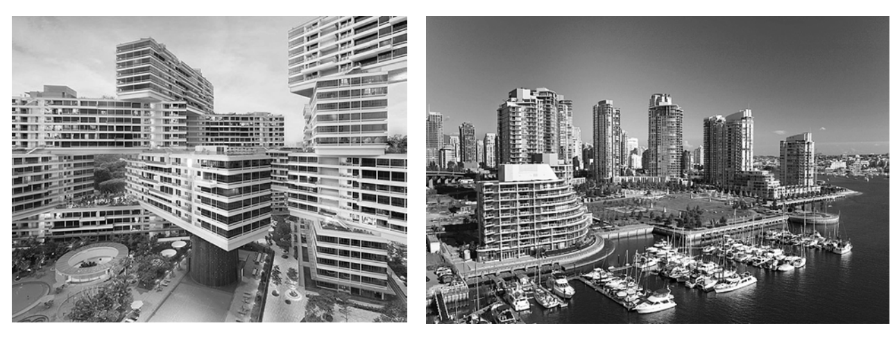
Fig. 3. Interlace Quarter in Singapore [21]