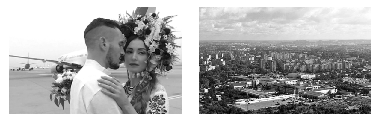
Fig. 1. Marriage at Boryspil Airport, Kyiv [38]

It is worth concentrating on the main motivating basis of this type of urban structure, which is easy access to a large selection of life opportunities. In that case, both components of this dichotomy are inversely proportional, which means that the easier accessibility tends to as much choice as possible, and the biggest choice wants to be easiest to access. In this context, the new urbanistic reality forms itself, the process of which does not depend on the environment in which it occurs. In other words, the potential of dichotomy (accessibility-choice) is capable of transforming any already existing urban objectivity, which has developed in previous historical periods as a result of different conditions. The main instrument here is the market response mechanisms for the proposal, which increasingly acquires the structure of the "wide choice" and pushes transforming of the surrounding areas towards the relevant to it ("wide choice") principle of mixed use [14].