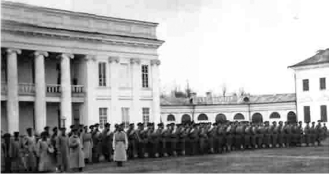
Fig. 7. Photo of the palace in 1912