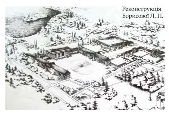
Fig. 4. Estate reconstruction (Borisova, 1974)

The pediment tympanum of the eastern and western wings was filled with a high relief heraldic composition and weapon attributes included ancient torsos wearing the cuirass and the helmet with count crown flanked the weapon and prolonged shields (Fig. 5). The latter contained the monogram of the letters "SP" meaning Stanislav Pototskyi. From the side of accessed road the shield of the tympanum have the family arms: to the left – "Pilawa" of Pototskyi family, to the right the fan of seven ostrich feathers – the arms of the Mnishek family (Lobko, 2008).