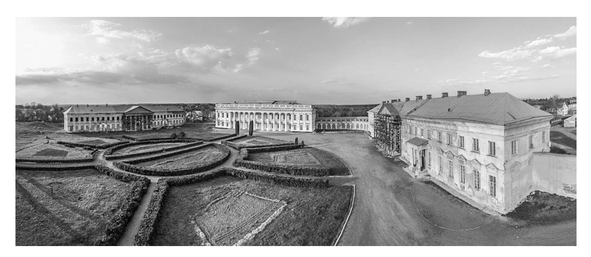
Fig. 1. The Pototskyi Palace in the town Tulchyn.

The historic preconditions of creating the palace ensemble in Tulchyn trace their roots to the 15<sup>th</sup> century. Modern Tulchyn is a district center located in the south part of Podillia Plateau, 82 km from the region center of Vinnitsia. The town came into being in the 15<sup>th</sup> century in the territory that at first constituted the Grand Prince Land Fund of Lithuanian state (Setsinski, 1911). The Polish historians of the 17<sup>th</sup> century assume that this settlement had the name of Nestervar and was built on the bank of the river Silnitsia. The main and the first mentions of this settlement date back to the early17<sup>th</sup> century, the time of its belonging to the major Polish magnates Kallinovski by which the castle and a wooden Catholic church were erected (Krzyżanowski, 1862). Due to Zboriv Agreementsigned signed in 1667 Nestervar was added to Cossack regiment of Bratslav Voivodeship, and after Andrusiv agreement signed in 1667 joined Polish-Lithuanian Commonwealth (Guldman, 1901).