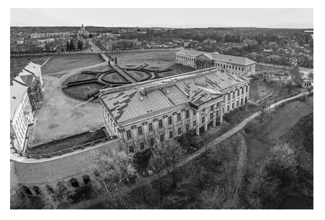
Fig. 5. Main axis palace-cathedral". (Rytus, 2016)

The problem of sewerage and heating systems in the palace was solved in up-to-date way. The water closets had to be situated in a middle part of the main building as well as in the three places of the wings. The vertical canals joint with the horizontal ones led up to the ground floor of each building under the floor. Further canals connected them with the reservoirs hidden in the ground at the bottom of the garden. The heating was provided due to the canals placed in the inner walls of both floors. Apart from the marble fireplaces, which gave only inconsiderable increase in temperature, some premises of the palace contained the stoves. Several such stoves had been preserved yet to the postwar period (Rolle, 1864).