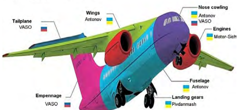
Fig. 2. Cooperation of aircrafts An-148