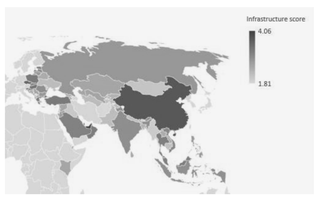
Fig. 2. Quality of trade- and transport-related infrastructure of BRI economies; Source: International LPI 201812

It should also be noted that apart from the LPI which indicates the experience of counterparties with the country's logistics infrastructure, it is important to understand the status of key infrastructure entities that will be involved as logistics hubs and key facilities in the BRI project. Table 1 show the results of the survey on the quality of ports, roads, railways and airports of the BRI members [7]: 100 - very low quality, 0 - good quality. In the table indicated part of the countries, which will participate in the BRI project.