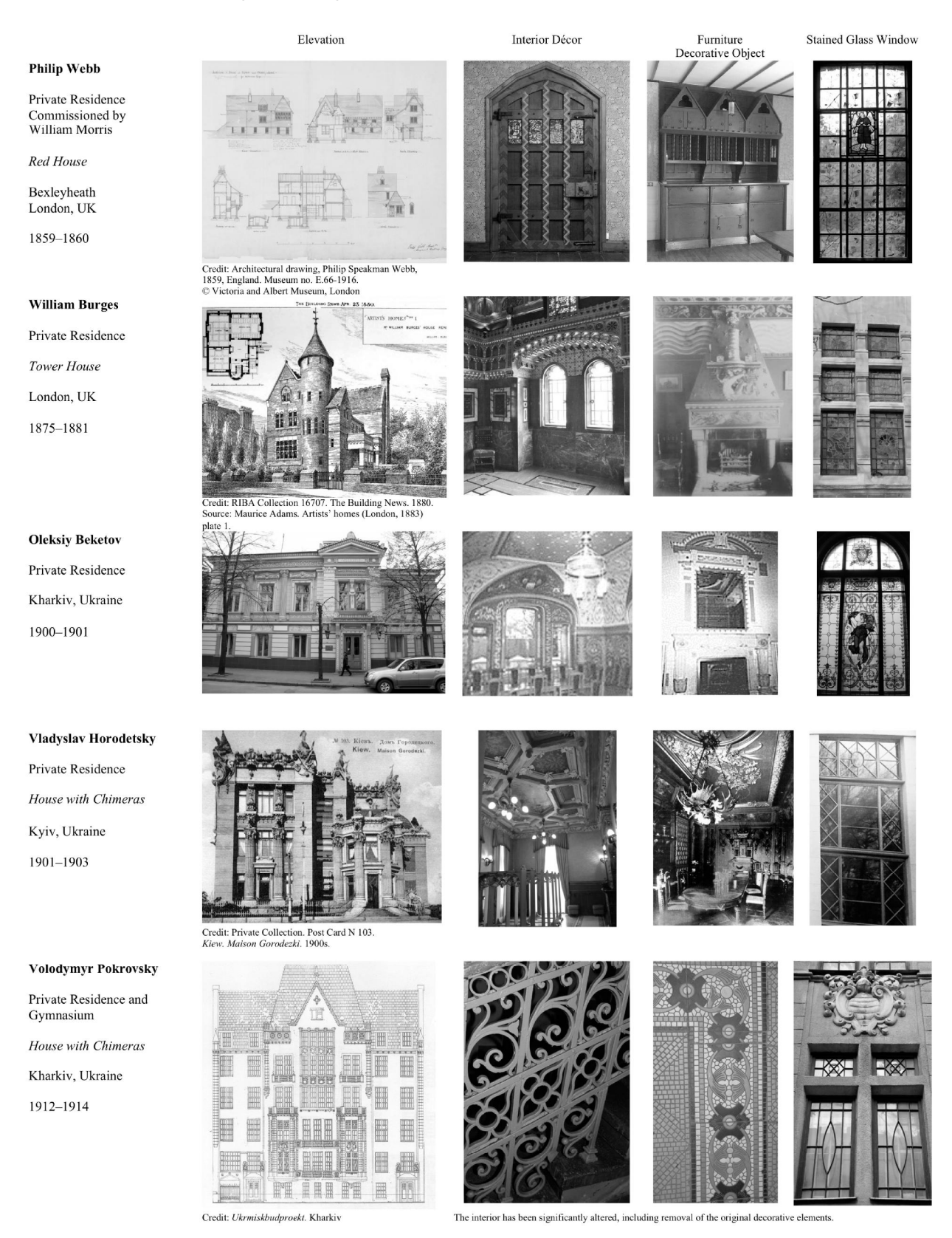
Fig. 1. Architecture as Gesamtkunstwerk in the late nineteenth and early twentieth century

the interior space. Pokrovsky thus convincingly translated the universal language of trees and flowers into the symbol of the Tree of Life. "This premise" – stated the leading Ukrainian scholar Volodymyr Yasiyevych, – "has become one of the bright and original manifestations of Art Nouveau in Kharkiv" [13].