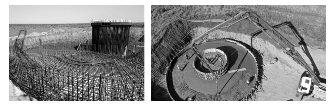
Fig. 3. Construction of monolithic foundations of wind turbines during the construction of the wind power plant in Orliv using ready-mixed concrete modified with polycarboxylate superplasticizers