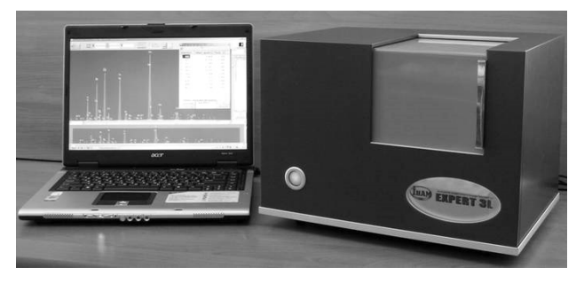
Fig. 2. analyzer EXPERT 3L

It is defined qualitative and quantitative composition of metals in soil samples near the landfill of phosphogypsum and near the area of the modifier by X-ray fluorescence (using analyzer EXPERT 3L (fig. 2)) method. EXPERT 3L analyzer is measured the mass fraction (%) of major chemical elements by X-ray fluorescence analysis. Range of measuring chemical elements (range control) is from Natrium (<sup>11</sup>Na) to Uranium (<sup>92</sup>U).