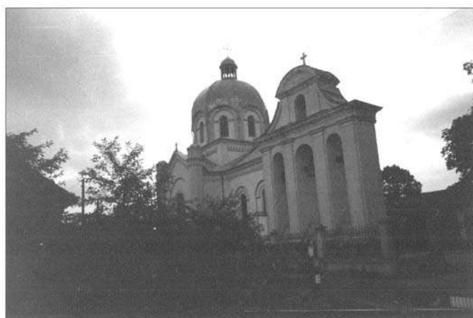
Fig. 3. Church in the village of Sasiv, Zolochiv district, built upon the project of Vasyl Nahirnyi in 1895; photo by S. Topylko, 1998

The architectural heritage of Vasyl Nahirnyi counts several hundreds of objects including churches, chapels, parochial houses, public and private buildings. The most valuable are village churches that make up the