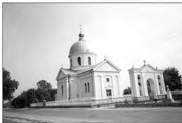
Fig. 2. Church in the village of Novyi Vytktiv, Radekhiv district, built upon the project of Vasyl Nahirnyi in 1900; photo by S. Topylko, 2003