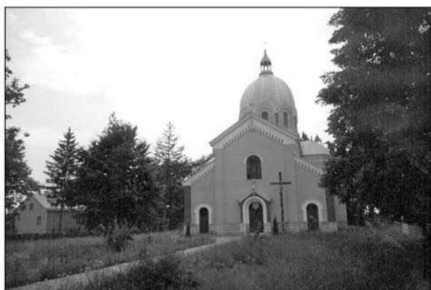
Fig. 1. Church in the village of Bilyi Kamin, Zolochiv district, built upon the project of Vasyl Nahirnyi in 1910; photo by S. Topylko, 2003

Furthermore, sacral objects still remained the most stable planning and compositional elements of small towns. There was a noticeable tendency to a reconstruction of sacral objects and the building of new, usually larger ones. The famous Galician architect Vasyl Nahirnyi designed a number of stone churches that were built in the researched towns at the end of the 19th – in early 20th century in Bilyi Kamin (1900), Bohorodchany (?), Velyki Mosty (1893), Dovhomostyska (1908), Kalush (1913), Klebanivka (1898), Kopychyntsi (1900), Leshniv (1905), Mykolayiv (1903), Vytktiv (Novyi)(1910), Yarychiv (Novyi) (1889), Novi Strilyshcha (1910-30), Sasiv (1895 (1898)), Skole (1892), Solotvyno (1904), Toporiv (?) (V. Slobodian, 1994, pp. 30–33). As a rule, churches were built on the place of the lost old sacral buildings (Fig. 1–3).