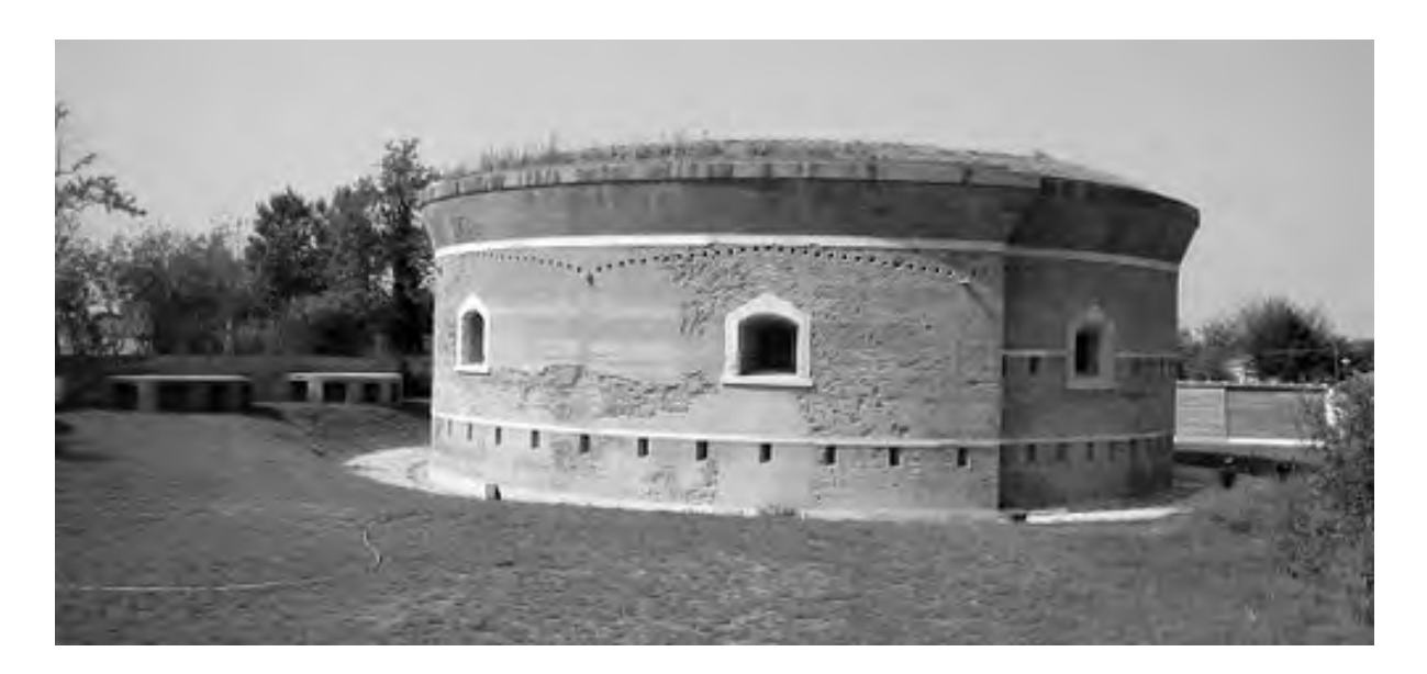
Fig. 4. Fort St. Erasmo

Relevant Habsburg works of military assets are: