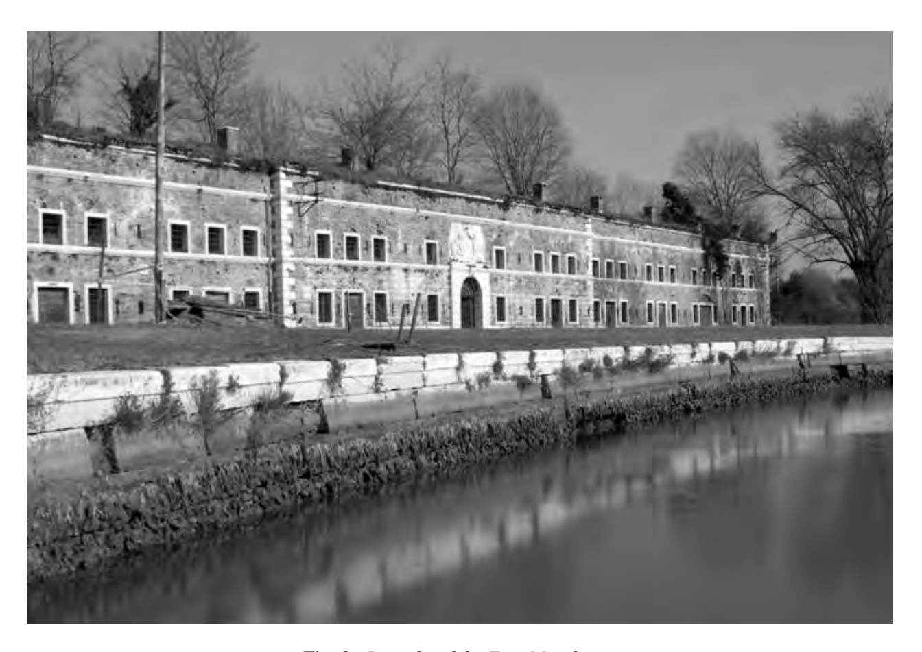
Fig. 3. Baracks of the Fort Mergherra

the nineteenth century and the beginning of the twentieth century it start to disappear the primary defence function of the fort and it undergoes its progressive transformation into a warehouse and logistic centre. This will lead in the time to the progressive addition of several volumetric increasing of poor architectonic value, but of simple operational functionality (warehouses, offices workplaces, garages, sleeping places, services). The mix of all the above-mentioned elements provide nowadays to the fort an aspect very similar to a citadel.