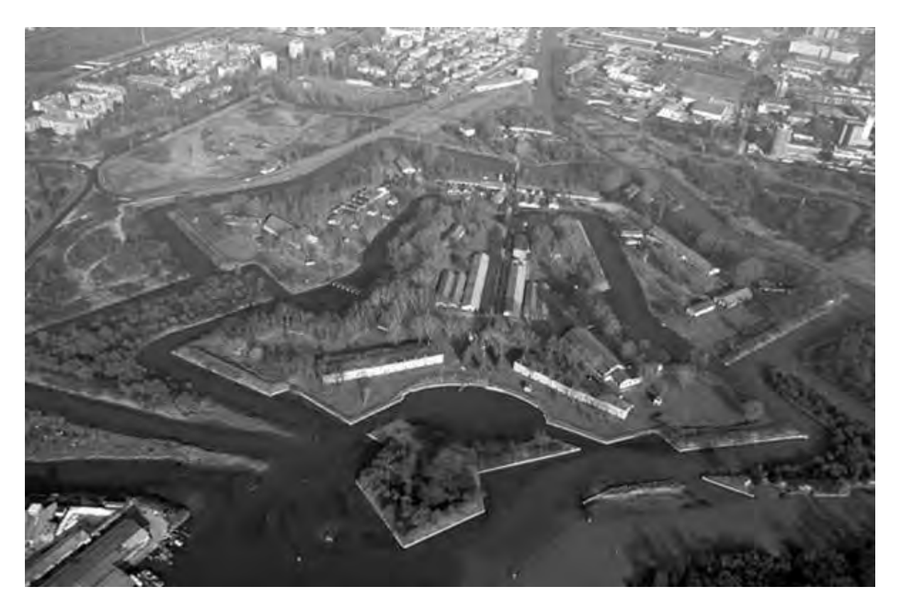
Fig. 2. Fort Mergherra – aeroview

The fall of the Republic of Venice and the subsequent French and Austrian governments have afterwards included the Venetian territory in a potential ring linked to the military architectures of the Mittle Europa. The starting point is the building of the first fortified asset in the mainland bordering the lagoon for the defence of the city of Venice. The building of Forte Marghera starts in 1805 on the site of the old village of Marghera. It is a strategic area located at the border of the Venetian lagoon whereas the brackish waters of the lagoon meets with the low lands of the first mainland featured by a grid of small natural canals, salt-marsh and the mouth of spring waters. Until the construction of the fort the village of Marghera was featured to be the starting/arrival point to/from Venice. The military works changes the function use, but it does not change the peculiar environmental context.