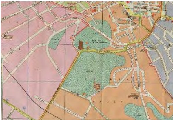
Fig. 5. Extract of “Lvov” layout for tourists (“Lviv. Tourist-oriented city layout”), 1979

Based on a Russian-language city layout “Lvov.Turistskaya Skhema”, almost identical city layouts were published in 1979 in English, German and French (edited by Yu. I. Loza). Names of streets, squares and parks were transliterated in Latin and were identical on all city layouts published in foreign languages (Fig. 5).