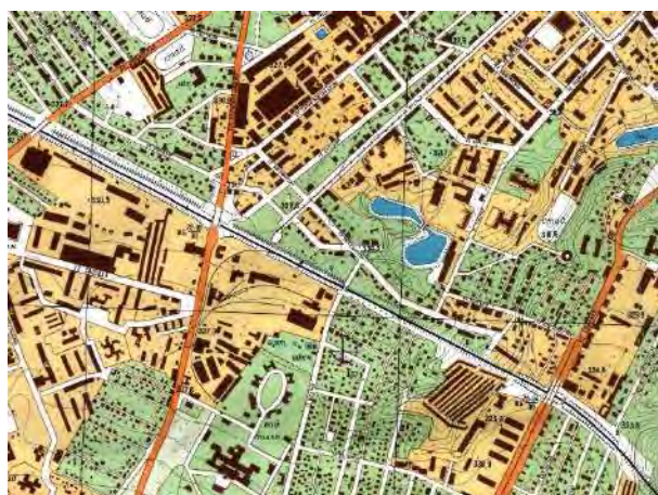
Fig. 3. Extract of a 1:10 000 city topographic map, 1987

Considering huge workload of the military map-makers being engaged with making topographic maps and plans of foreign territories, the works on compilation of such city maps and their further preparation for publishing were often vested with the hands of civilians. If that was the case, then topographic maps could be printed in two ways: labelled by the Central Command of the Armed Forces of the USSR and labelled by GUGK. For example, the last edition of a 1:10 000 scale Lviv topographic map for military needs in the Soviet period was made by Company No. 13. The related works on map compilation and preparation for publishing were done as ordered by the Military Topographic Department (the so-called “Client No. 9”). The map was compiled in 1975 and further updated in 1984 according to the aerial survey and field survey materials. In November 1987, the map was published on 4 sheets at the Kyiv military mapping factory (Fig. 3).