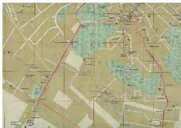
Fig. 6. Extract of “Lvov. Skhema pasazhirskogo transporta” (“Lviv. Layout of public vehicle routes”), 1984

Attempts of democratic changes in the Soviet society during the second half of 1980s had a positive effect on mapping development. The guidelines “Instruksiya o poryadke sostavleniya i izdaniya planov gorodov i drugikh naselyonnykh punktov, prednaznachennykh dlya otkrytogo opublikovaniya i s grifom “dlya sluzhebnogo polzovaniya” (SPG-88)” (“Guidelines on Making and Publishing Maps of Cities and Other Towns and Settlements, Which are Intended For a Wider Public and For Internal Use”) were developed and approved, and replaced Instruksiya SPG-73 [Instruction SPG-88]. The city maps intended for a wider public could now be made in a 1:5 000 or smaller scale; maps for internal use in a 1:2 000 or smaller scale. True coordinates of geographic locations on public maps were not allowed to be more accurate than 150 m. Their north-south direction was normally 2–3° deviated. It became possible to visualize the relief with shading and gradation, with hypsometric tinting, with symbols (steeps, ravines, rocks), with names of relief objects written on maps and layouts.