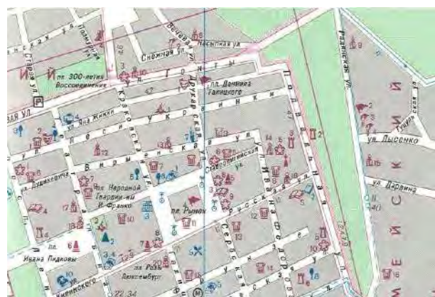
Fig. 7. Extract of a page from “Lvov. Atlas turista” (“Lviv. Atlas for tourists”), 1989

The scientific novelty of the research is that it is the first time when mapping of Lviv Soviet-period, a big administrative, industrial, cultural and tourist center of the Western Ukraine, has been studied chronologically, from a different perspective. Specific nature of map-making and information of the major types of city maps for military needs, for the city business development needs, for the needs of the city guests and residents has been outlined. Specific notice of the effect on Lviv mapping development has been done, considering the security restrictions imposed on publication of cartographic information in the Soviet period.