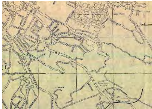
Fig. 1. Extract of “Skhematychnyi plan mista Lvova” (“Lviv city layout”), 1947

For a wider public, “Skhematychnyi plan mista Lvova” (“Lviv City Layout”) was available, published in 1947 by the Volunteer Fire-Fighting Association in 15,000 copies (Fig. 1). A single-color layout (advertisement – in two colors) was made by Lviv Oblproekt (authored by L. Tryfon, edited by V. Novikov and P. Mischenko). A 50.5 \times 67.5 cm layout visualized all the city streets and squares, with their new names, and that was the key benefit of this edition. Still, the layout was pretty simple cartographically. An identification list of the city streets and squares was on the reverse of the layout.