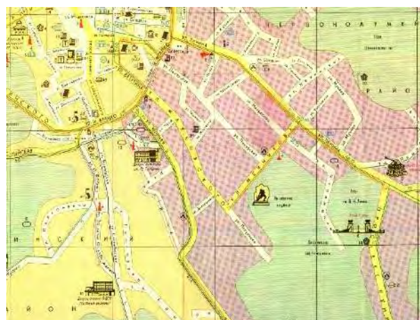
Fig. 4. Extract of “Lvov.Turistskaya Skhema” (“Lviv. Tourist-oriented city layout”), 1974

The information and accuracy of geographic presentation in the first edition of a tourist-oriented city layout of 1974 (edited by O. I. Kolyada) was only a bit different from that in the previous edition made by “Kamenyar” book publisher [Lviv. Tourist scheme, 1974] (Fig. 4). However, the size was slightly reduced (49 × 69 cm) and the scale was slightly increased. That is why the area of the city mapping somewhat decreased. Due to an almost 10 % increase in the number of streets, almost the same number of streets (218) and with their same drawing was presented and their names were identified in writing on the layout. The first GUGK’s layouts also had no railways (1974, 1976), which appeared in the subsequent editions. The layout coloring definitely got better – this was also contributed by colored photos at the layout front and back. The city was colored by districts, which from then on started being introduced on tourist-oriented layouts.