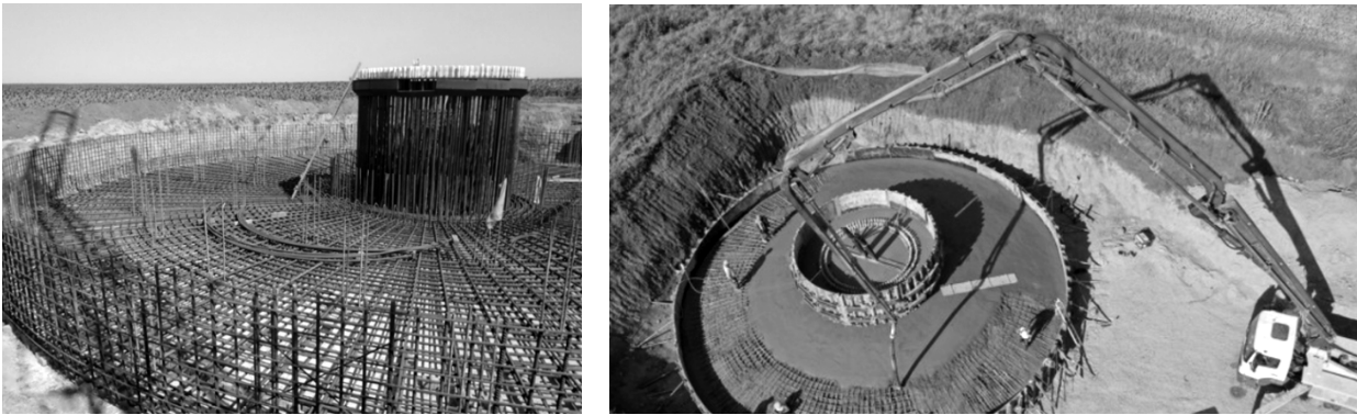
Fig. 3. Construction of monolithic foundations of wind turbines during the construction of the wind power plant in Orliw using ready-mixed concrete modified with polycarboxylate superplasticizers